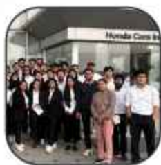
Industrial Visit to Honda