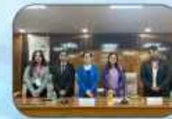
MOOT Court activity