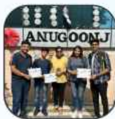
Anugoonj GGSUPI Fest