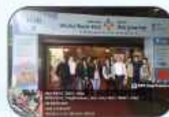
Visit to World Book Fair