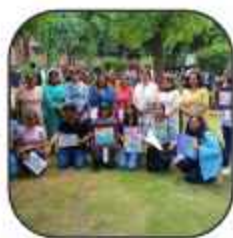
Eco Club Activity