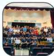
NSS Health Camp